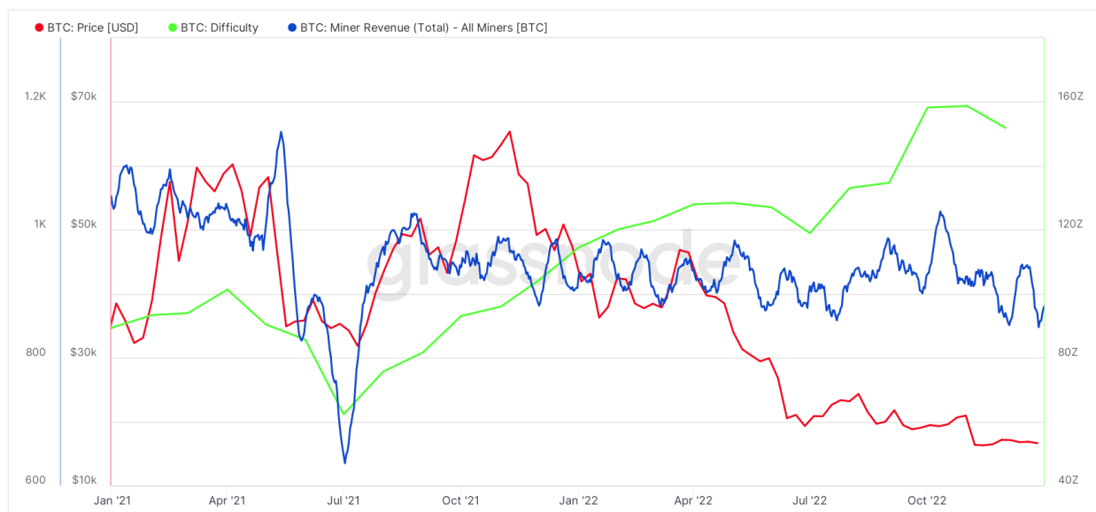
Bitcoin: Price (USD) vs. Mining Difficulty vs. Total Miner Revenue

For reference, the following chart shows Bitcoin price vs Bitcoin miners' revenues (in Bitcoin block rewards and transaction fees) vs block difficulty* for the 24-month period from January 2021 to December 2022: